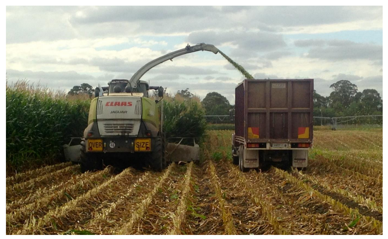
Figure 2: Harvesting Maize Silage