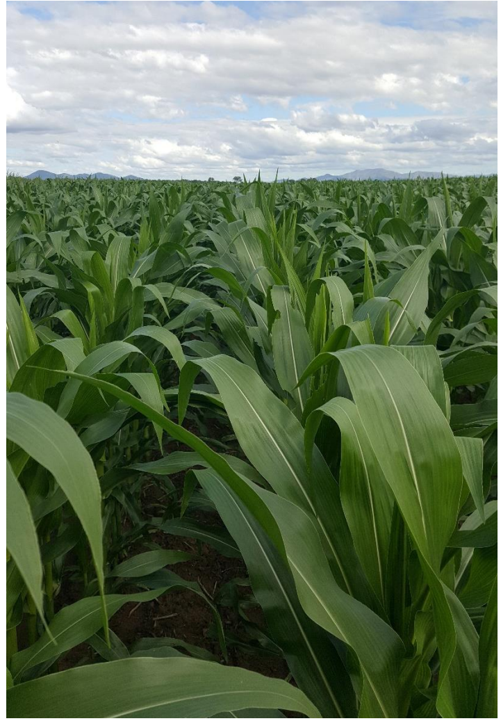
Figure 1: Maize growing during the season