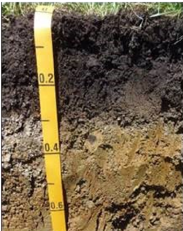
Figure 3 Photo showing soil texture layers