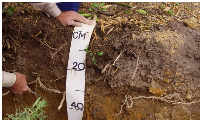
Figure 5 Measuring soil texture layers