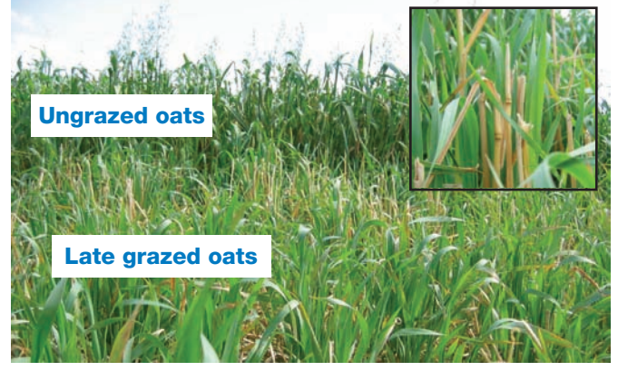
Figure 5. Ungrazed and late grazed oats crop at 3030 trials in Yarram (29 September 2007).