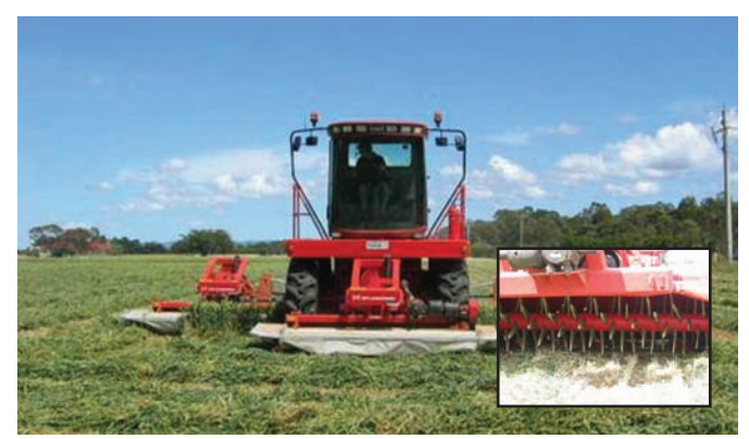
Figure 7. Triple mower–conditioner used for wheat in 3030 Project on-farm trials in Foster (2006).