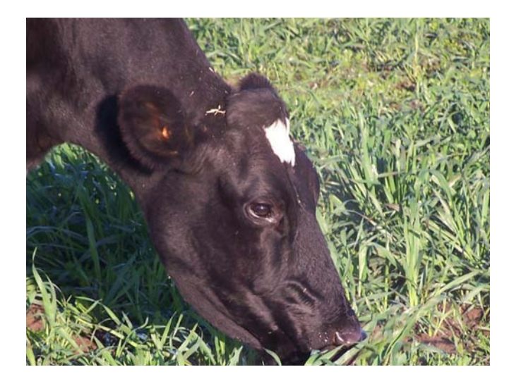
Figure 3. Grazing at early tillering stage (3030 Project study at Terang).