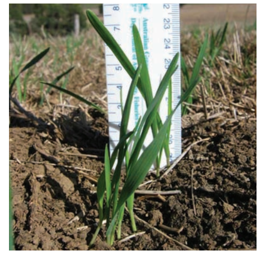
Figure 2. Height of direct-drilled oats two weeks after sowing (sown 5 April 2007) at 3030 Project on-farm trial near Warragul.

Once sown, the availability of herbicides for the control of grass weeds in some cereals is low. Fallowing over summer in dry regions was necessary to reduce weed risks and conserve some soil moisture prior to sowing.