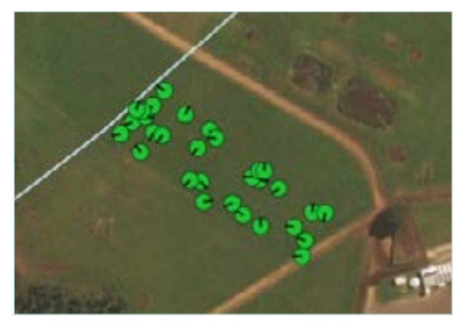
Overview of experimental herd grazing with a virtual temporary frontfence (white line). Image taken from the eShepherd<sup>™</sup> user interface. Green circles show individual cows

Cows appeared to quickly adapt to the technology and learnt to respond to the virtual front-fence with cohorts of cows observed to move away from the virtual front-fence upon an individual cow receiving the audio cue. Results also suggest the virtual herding eShepherd<sup>™</sup> system did not adversely affect the spatial distribution of pasture consumption by cows within the inclusion zone.