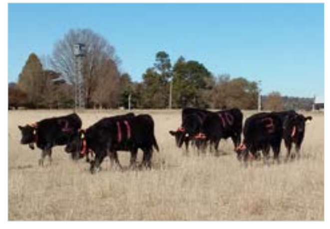
Cattle moving down the paddock in the herding study at CSIRO facilities at Armidale

The eShepherd<sup>™</sup> system is under continual updates and improvements which may result in more efficient herding capabilities for moving animals over smaller distances in much shorter time frames. From the results of the present studies, we are unsure how animals may perform if herding was something that happened regularly and they were more accustomed to what was expected of them with the collar signals being 'reminders' rather than something new for the animals to learn.