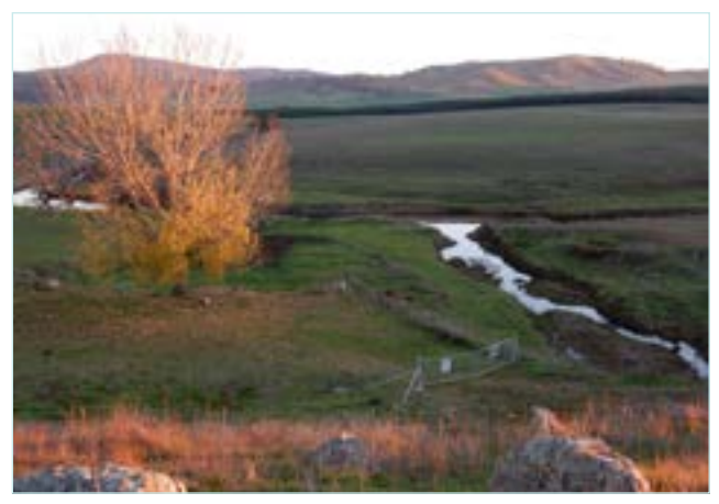
Landscape of the study where virtual fencing was used to exclude cattle from the riparian zone at Tumbarumba

GPS movement patterns showed that the virtual fence line successfully excluded animals from the riparian zone for the majority of the fence activation period (see Figure 1). All audio and electrical stimuli that each animal received were also recorded. Individual animals approached the fence line daily, but there was high variation in how often specific individuals interacted with the virtual fence.