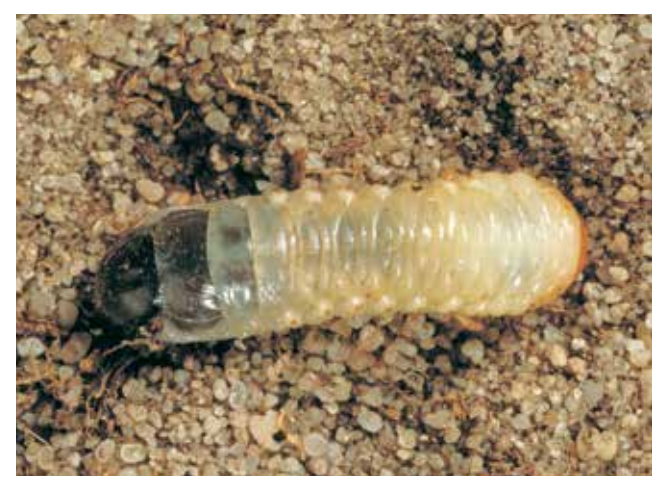
African black beetle larva.

ABB larvae have six legs, a brown head capsule, and a 'C-shaped' body. The larval body is grey in appearance when young but transitions to creamy-white when mature. They are ~5 mm when they hatch, growing to ~25 mm in length. The larvae damage pastures by pruning or completely severing grass roots close to the crown of the plant. In severe cases where infestation occurs, pastures become patchy and can be rolled back like a carpet.