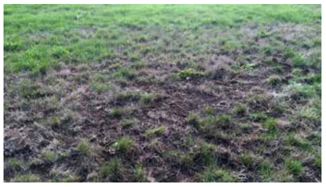
African black beetle pasture damage.

There are multiple yellowheaded cockchafer species and while their life cycles are largely unknown, they are thought to reach the most damaging third instar larval stage during winter.