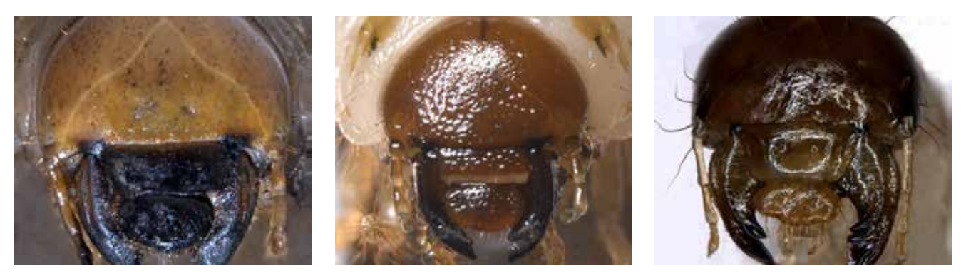
ABB, redheaded pasture cockchafer and blackheaded pasture cockchafer head capsules, respectively.