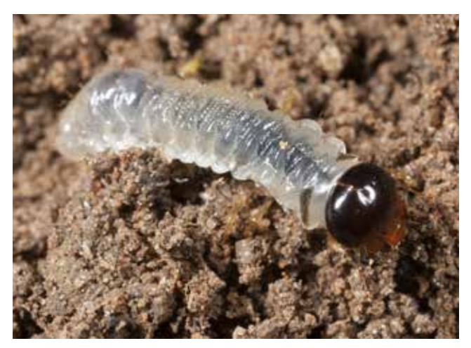
Blackheaded pasture cockchafer larva.

The adult beetle form of ABB is 12–14 mm long, has a brown to black body with indented longitudinal striations on the wing covers, and flares and spurs on its legs. Adult beetles have strong nocturnal flight activity, and disperse during their 'roaming' stage primarily in autumn, leading to paddocks becoming infested. The adults feed on the stems of a variety of young plants either underground or above the soil surface, often killing growing points so that the central shoots wither and the plant dies.