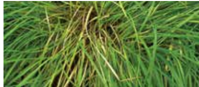
Figure 1 Cut pastures early