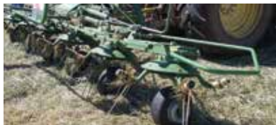
Figure 4 Tyned mower conditioner