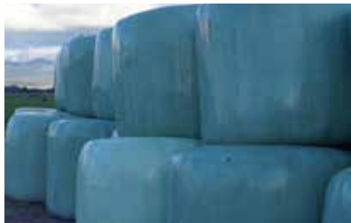
Figure 8 Silage bales