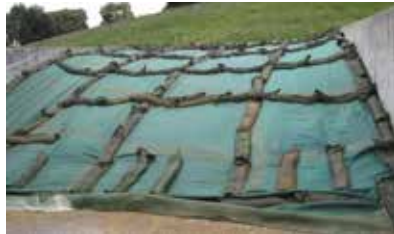
Figure 7 Sealing stacks with bags