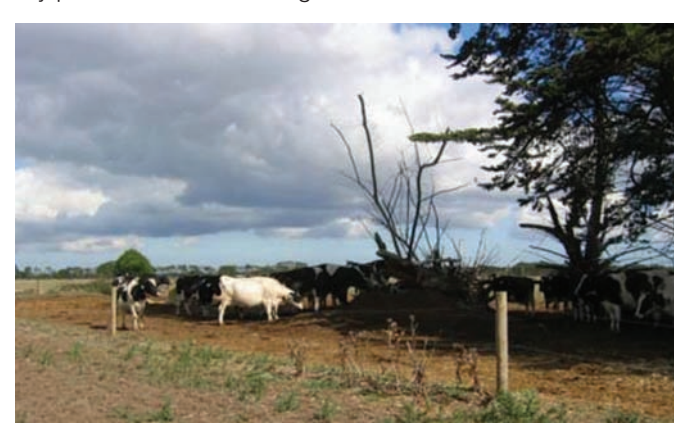
Figure 4. Cows fed on a sacrifice area in early autumn at the 3030 Project farmlets at Terang.

This management increases the persistency of a perennial ryegrass sward (see the 'Grazing management to maximize growth and nutritive value' Information Sheet for details), which will be in a much better position to recover from the dry period once the first significant rainfall event occurs.