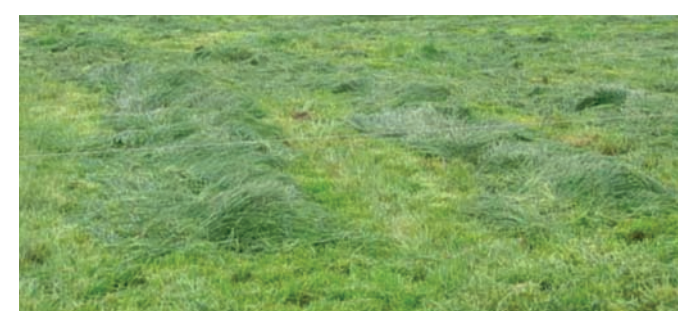
Figure 3. Pre-grazed topped pasture at the 3030 Project farmlets at Terang.

If rain is forecast for the next day, do not top the pasture because there is a high risk of increased wastage of pasture.