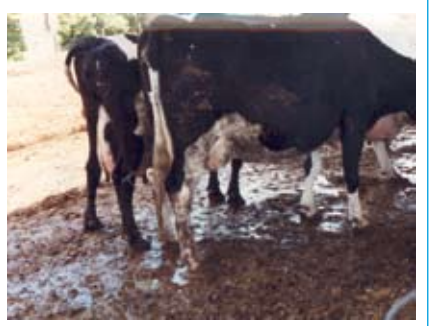
These cows are at increased risk of environmental mastitis.