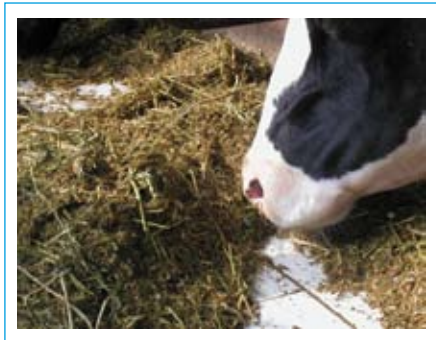
Cows will sort poorly mixed feeds, increasing the risk of acidosis.

These feed.FIBRE.future Sect Sheets are sponsored by: