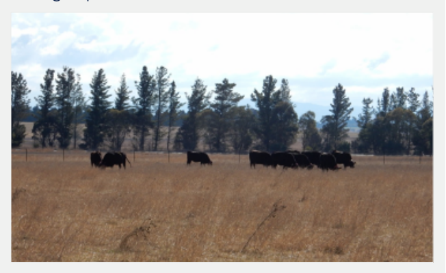
Figure 2 Cattle used to test virtual herding in a 6 ha paddock at CSIRO, Armidale. Herding was more challenging when some animals were distant from the main group.

A front and back fence may then become a viable option for moving cattle around a farm. Fences that automatically update based on animal position within the paddock may also be possible (herding fences were manually activated in the research trials).