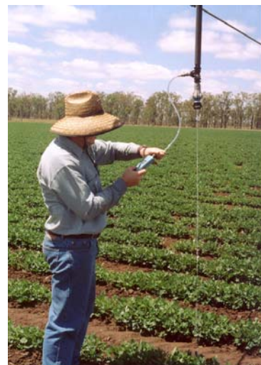
Centre pivot pressure check

If a flow meter is fitted, take a reading of the flow delivered to the entire machine.