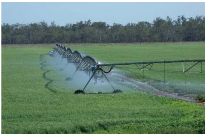
Catch can layout and centre pivot

For machines using LEPA socks or bubblers, the same calculations can be performed by substituting the discharge at each outlet for the catch can data.