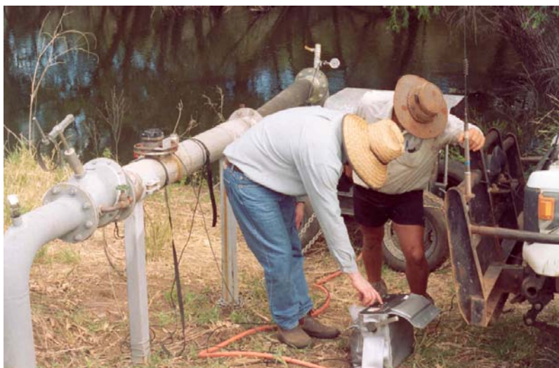
Checking flow rate at river pump