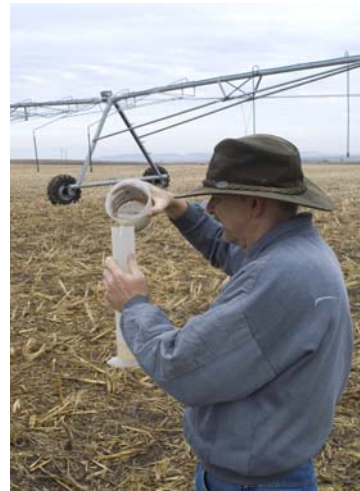
Performing system check on centre pivot