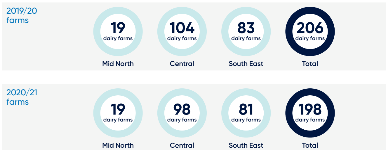
Table 1 SA Milk Production by region 2019/20 and 2020/21