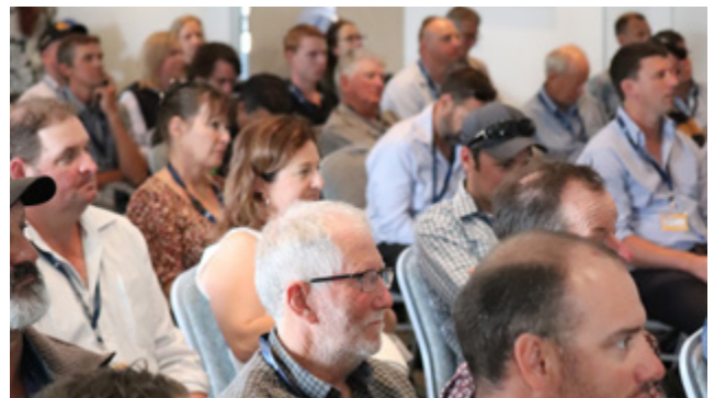
2021 DairySA Central Conference

FY21 saw the second year of DairySA's participation in a three year, national 'Smarter Irrigation for Profit2' project which will capture data over three irrigation seasons at sites located across the seven Australian mainland dairy regions – with two being in South Australia's Mt Compass and Mt Gambier. It focusses on the key driver 'What's my yield gap? Maximising water productivity', using the latest soil moisture technology and cost-effective management practices with an aim to increase irrigation production and profit, with the results to benefit many dairyfarmers. A regular irrigation report – dubbed the SIP2 Update (Smarter Irrigation for Profit) was – and will continue to be – prepared and sent out widely on a weekly basis. Twenty farmers and Service Providers are participating in the project, set to benefit hundreds of others. Five SIP2 workshops and field visits were held, engaging over thirty attendees.