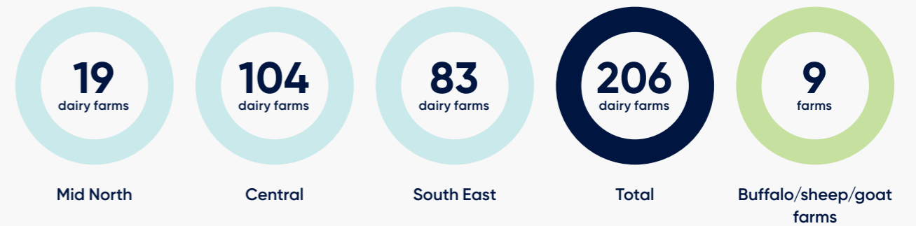
Table 1 SA Milk Production by region 2018/19 and 2019/20