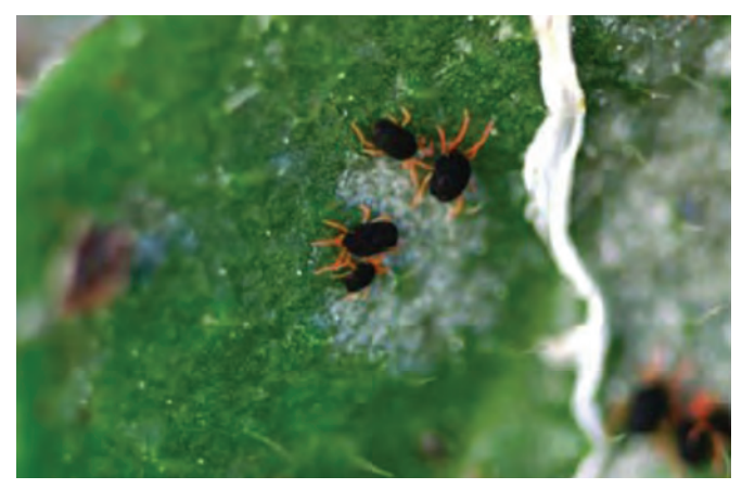
Figure 7. Red-legged earth mites (RLEM).

The monitoring should be done in the morning or on overcast days, since the mites tend to hide at the base of plants or crawl into cracks in the ground to avoid heat and cold. Approach the patch very quietly and observe for 30 seconds to check for RLEM presence. If the mites are not seen on seedlings, it is possible to find them in broadleaf weeds, especially capeweed. Carefully lifting up the leaves closest to the soil and checking the soil surface for mites can also help, as the RLEM spends 90% of its time on the soil surface rather than on plants.