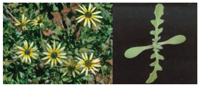
Figure 2. Capeweed at the flowering (left) and seedling (right) stages.

Capeweed is adapted to fertile soils and tends to colonise areas of bare ground in a pasture sward (Figure 2). It is known for its capacity to tolerate drought conditions better than most crops and pastures. It has been reported that 20% of its seed can remain dormant for more than two years but this depends on the ecotype (sub-types within the same species which have been developed in a region) and on how deep the seed is buried.