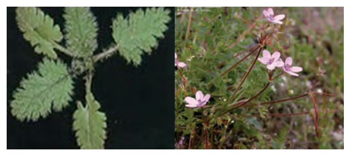
Figure 3. Erodium at the vegetative (left) and flowering (right) stages.

Erodium is a broadleaved annual weed that germinates after late summer-autumn rains (Figure 3). It is most prevalent in sandy or gravelly soils. Erodium is similar to capeweed in terms of growth pattern, drought tolerance, autumn seedling competition and colonisation of bare ground.