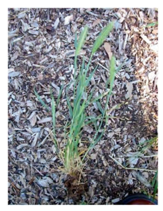
Figure 1. Barley grass plant with elongated stems carrying seed heads.

Barley grass produces unpalatable seed heads from early to late spring before the plant finishes its cycle and dies (see Figure 1). There is no evidence that barley grass can produce hard seeds and so 99% of the seed produced in spring will germinate in the next autumn if the conditions are favourable. Barley grass seeds are readily dispersed by animals or as a contaminant of hay and feed grains.