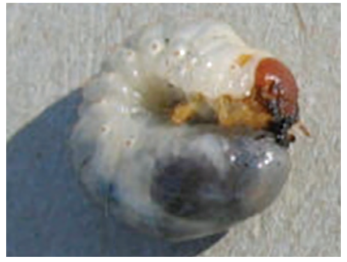
Figure 6. Red-headed cockchafer grub. (Photo: DPI Victoria).

The body of the larvae is similar to that of the black-headed grub, but their heads are red or orange (Figure 6).