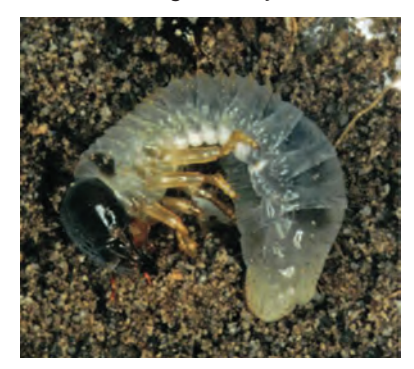
Figure 4. Black-headed cockchafer grub..

Black-headed cockchafers have a one-year life cycle. The adults emerge from the ground in summer (around January) and lay their eggs in the soil underneath short pastures. The larvae (see Figure 4) emerge in the autumn to feed from plants. Black-headed cockchafers do not prefer the extremes of heavy clay or very sandy soils, and numbers can decline significantly if the soil is saturated.