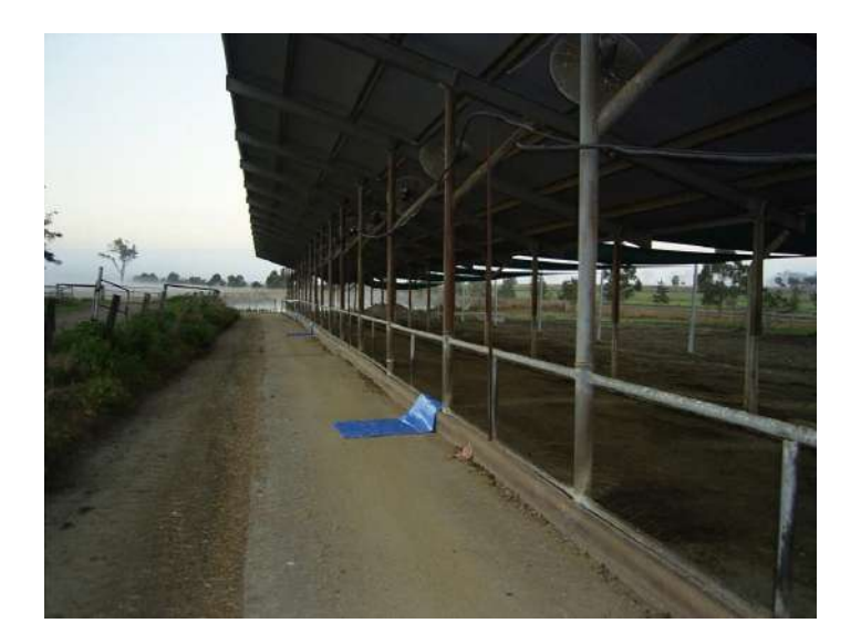
Figure D. Placing the tarpaulins before feed-out (one sided trough)