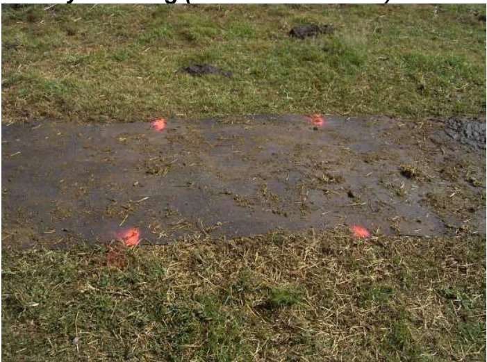
High feed refusal and wastage (18%) for cattle fed lucerne and cereal hay on pasture:

Minor feed refusal and wastage (2.7%) for cattle fed lucerne hay on conveyer belting (feed-out method 3):