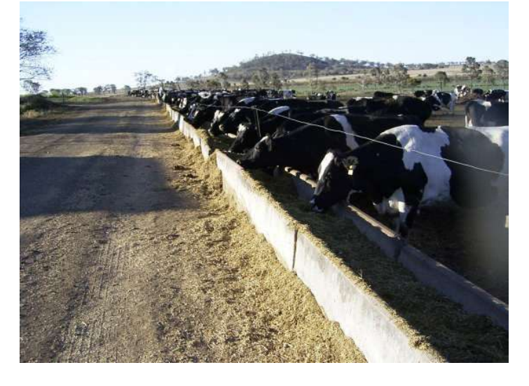
High feed refusal in a rotary dairy:

Cows wasting feed due to the design of troughs allowing cows to push feed over the side: