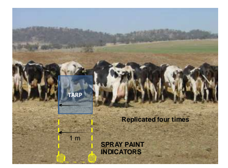
Figure A. Feeding on the bare ground.