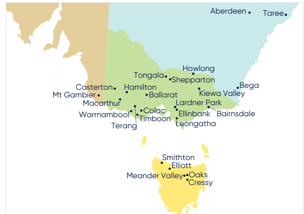
Figure 1 Map of trial locations across South-eastern Australia that contributed to the FVI.

Across the three different species of ryegrass, the Performance Value is expressed as the percentage change in yield relative to a selected reference cultivar that effectively acts as the genetic base for that species in the FVI.