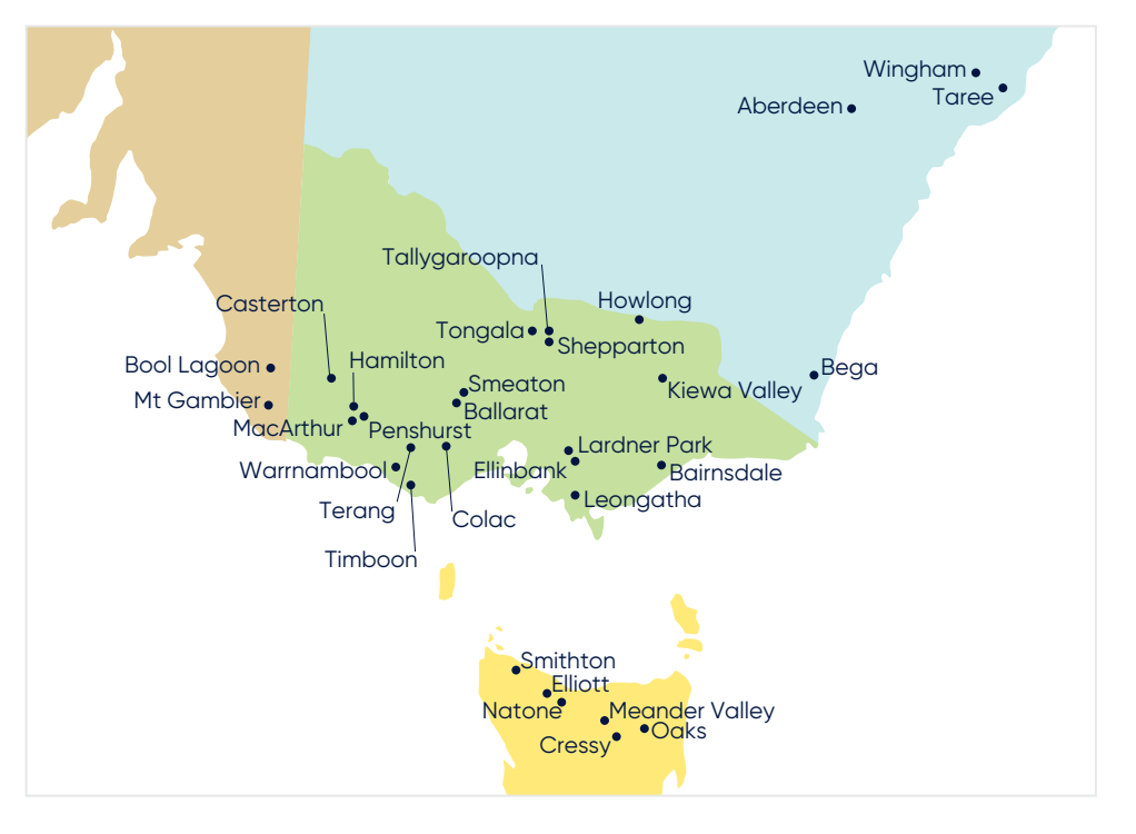
Figure 1 Map of trial locations across South-eastern Australia used in the 2025 FVI.