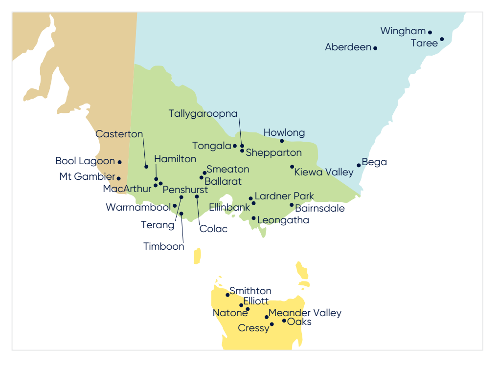
Figure 1 Map of trial locations across South-eastern Australia used in the 2025 FVI.