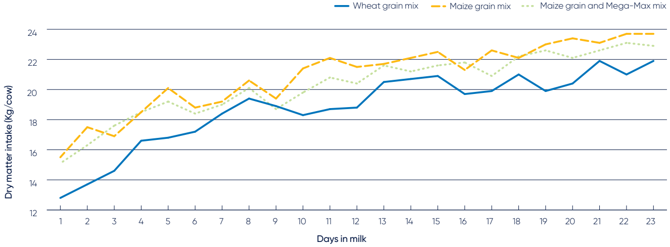
Figure 1 Daily dry matter intake of each treatment where lucerne hay was used as the forage base for the first 23 days in milk.