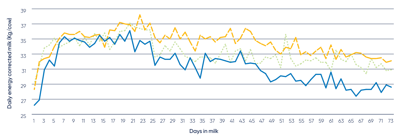
Figure 2 Energy corrected milk yield of each treatment across the 72 days of the experiment where lucerne hay was used as the forage base for the first 23 days in milk.

As shown in Figure 2, milk yield was highest over both the treatment and carryover periods for cows consuming the maize grain-based concentrate for the first 23 days. There was no additional feed intake or milk yield benefit observed from adding Mega-Max as a protected fat supplement to the maize grain-based concentrate.