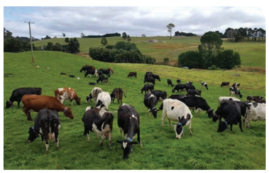
Cows grazing at Elliot Dairy Research Centre in Tasmania