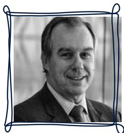
DR MALCOLM RILEY

People with lactose intolerance are advised to consume dairy foods in relatively small amounts, spread throughout the day and preferably consumed with other food.