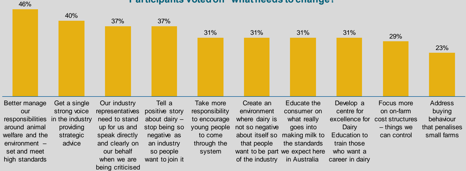
Participants voted on “what needs to change?”